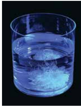
Polyalkylene Glycol (PAG)